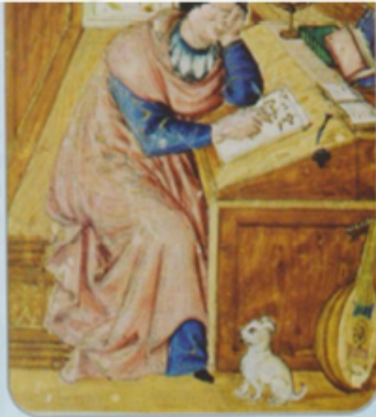
Petrarch often wrote letters to Cicero and other figures from classical times.

son of guidance you gave your self. O great father of Roman elo- quence! Not I alone but all who deck themselves with the flowers of Latin speech render thanks unto you. It is from your well- springs that we draw the streams that water our meads. You, we freely acknowledge, are the leader who marshals us; yours are the words of encouragement that sustain us; yours is the light that illumines the path before