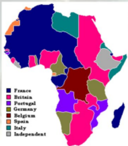
Africa is divided at a conference in Germany