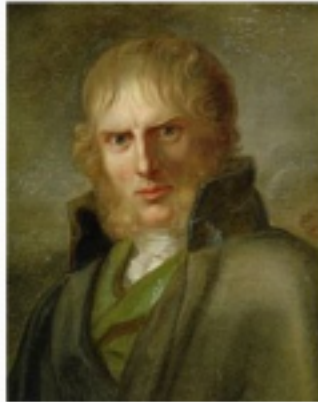
Casper David Friedrich