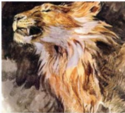
Unit 11, Lesson 1, Day 2

He was a French Painter who loved to paint scenes from exotic places he visited.